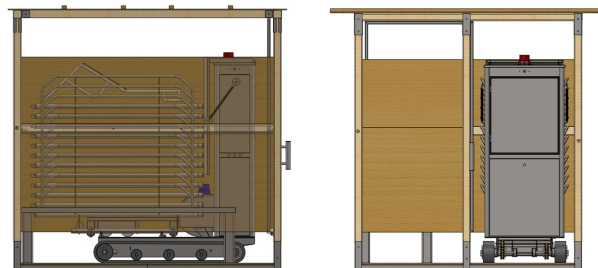
seatrac™ mover fits completely into storage room with lockable door to protect against vandalism